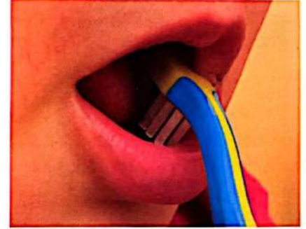
BRUSHING THE BACK TEETH

Brush the biting and grinding surfaces of back teeth with a gentle back-and-forth motion. Clean every surface of every tooth. Brush around the gum line of each tooth. Your dentist may have further advice on use of the toothbrush.