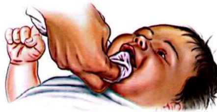
Use a moistened face washer to gently clean your baby's gums after every feed.

Children tend to imitate parents' behaviours. If nutrition, oral hygiene and