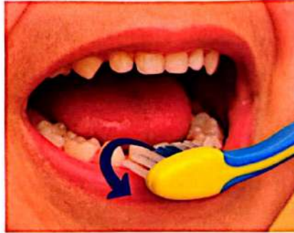
GOOD BRUSHING TECHNIQUE

Move the brush gently in small circles to clean the front surfaces of your child's teeth. To reach inner surfaces, tilt the toothbrush. Avoid side-to-side scrubbing, which can damage teeth and gums. Brush for about two minutes, if your child will tolerate it.